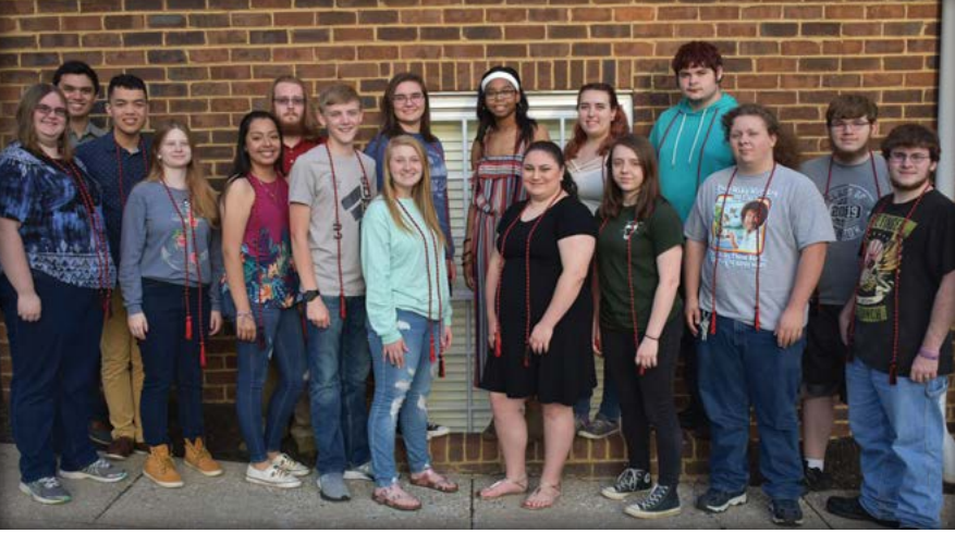
KinderCamps prepare for School Success