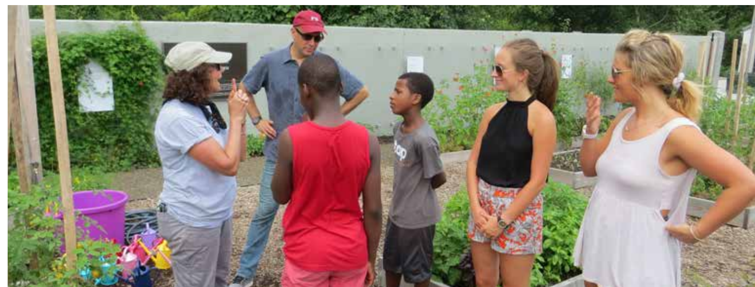
Scholars complete day of service at the Children's Garden in The Bronx, New York

To me, the opportunity of attending college is amazing. Yes, I will grow academically. But as a person, the experiences that it will provide me are second to none!"