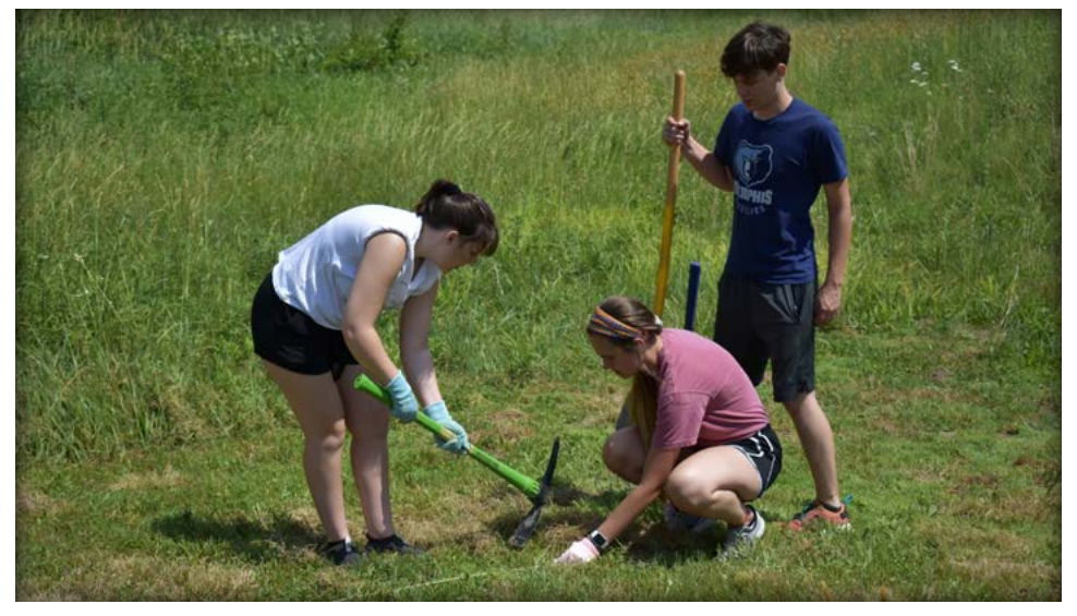
Niswonger Scholars learn about the "Refugee Experience" at the Niswonger Valleybrook Campus